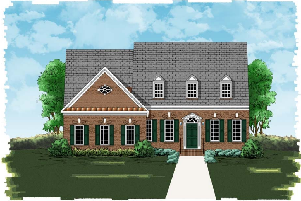
ELEVATION "A" SHOWN