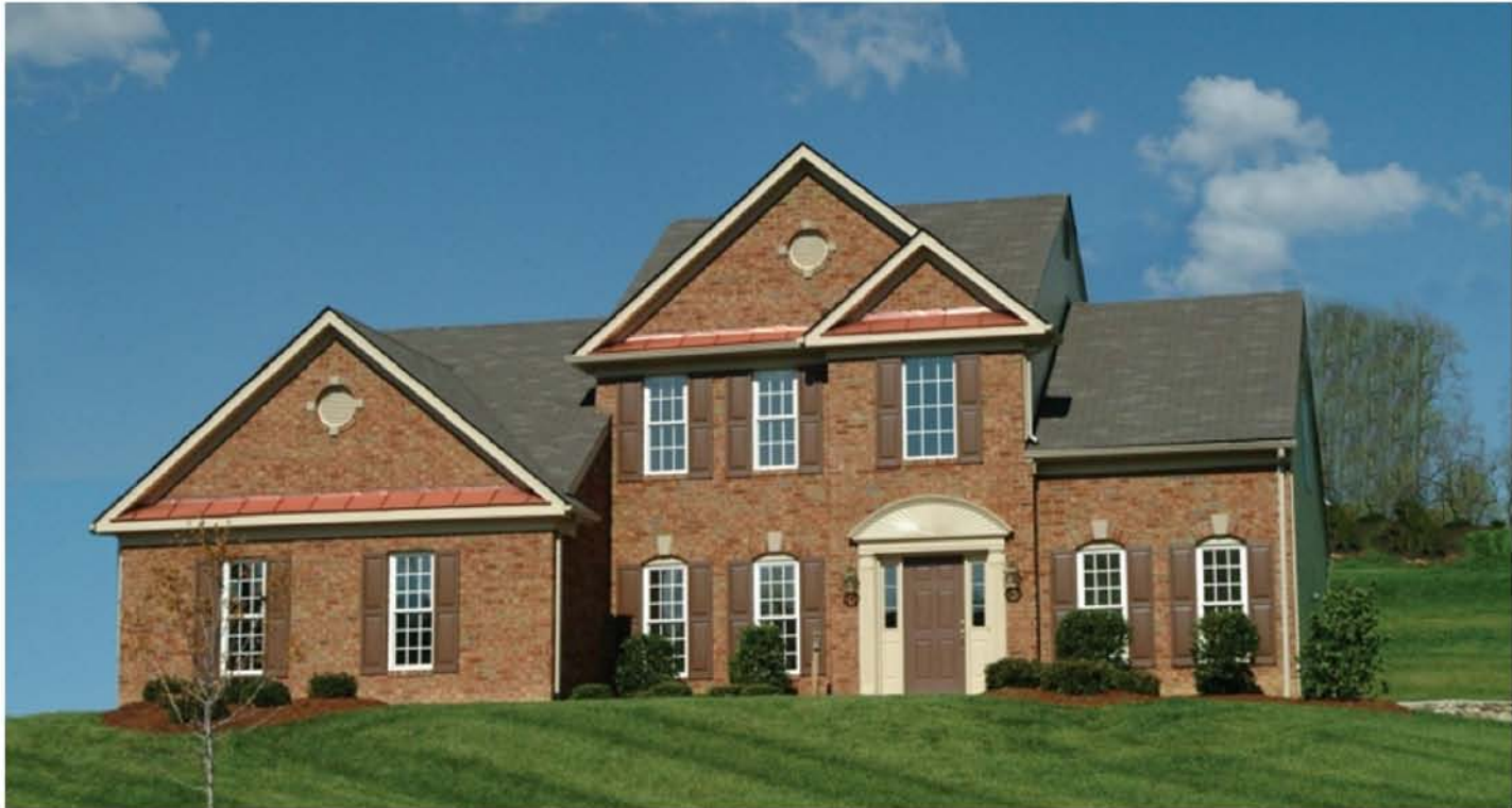
ELEVATION "5" SHOWN